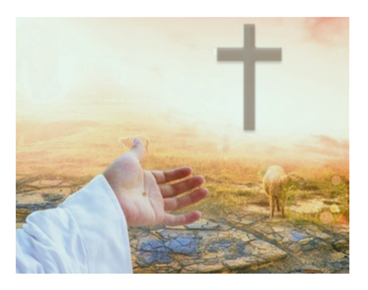
"Come and See" August 6, 2023