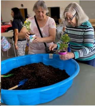
Mission Monday community outreach.