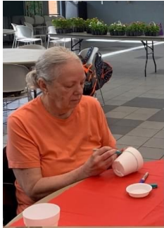
Our residents visiting Spring Branch Presbyterian Academy.