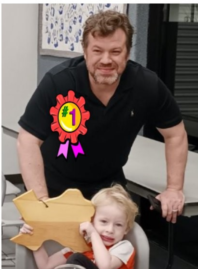
Drew Wynne Academy Parent