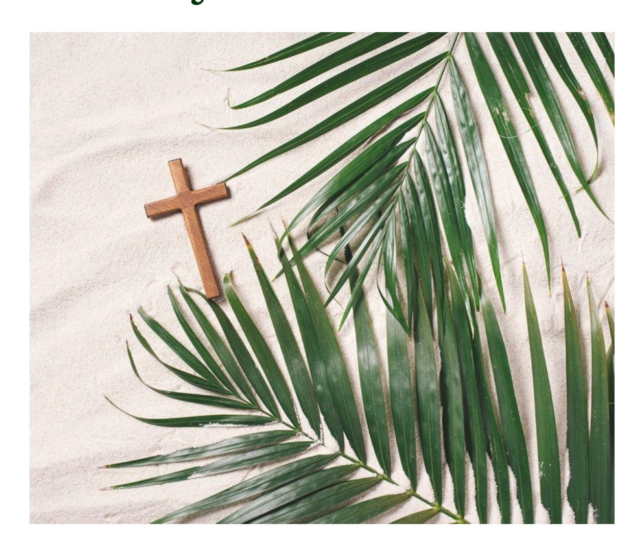
Palm Sunday April 13, 2025